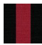
Jet Black & Natural Jockey Red (27)

Other color combinations available by special order