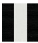
Jet Black & (240)