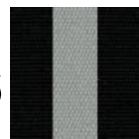
Jet Black & Cadet Gray (210)