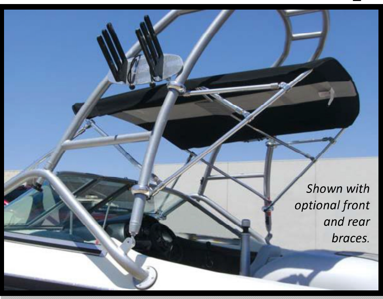
Shown with optional front and rear braces.

Convenient storage design allows top to be secured to the tower when folded back and not in use.