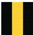
Jet Black & Sunflower Yellow (229)