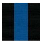
Jet Black & Pacific Blue (24)